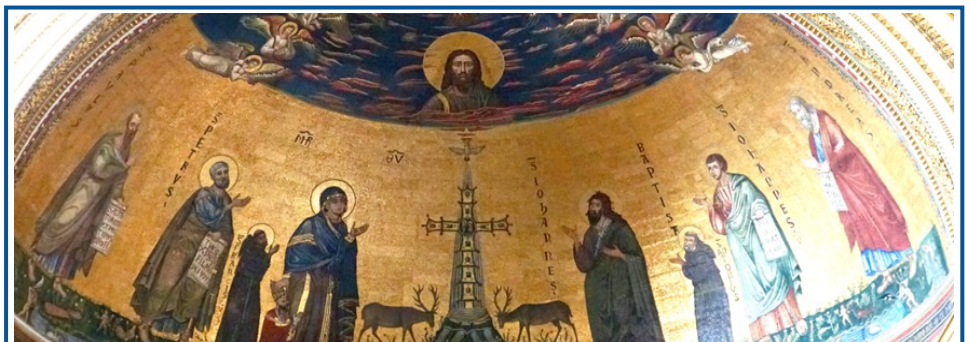
' The mosaic in the Lateran Basilica in Rome '

CFP - Centre for Peace FM - Foundation Mass