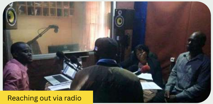
Reaching out via radio