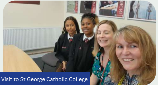
Visit to St George Catholic College

St. George Catholic College, Southampton was linked with St. Joseph's Mankon, Bamenda in 2024. St Joseph's is a new Secondary School that was created due to a need to educate the many young people who have been displaced by the recent civil conflict in Bamenda. St. George's College raised over £3,000 during their Romero day. In addition, as part of their Faith Day, to help student get to know more about the lives and faith of the students in Bamenda. The UK students wrote messages to their counterparts at St Joseph's.