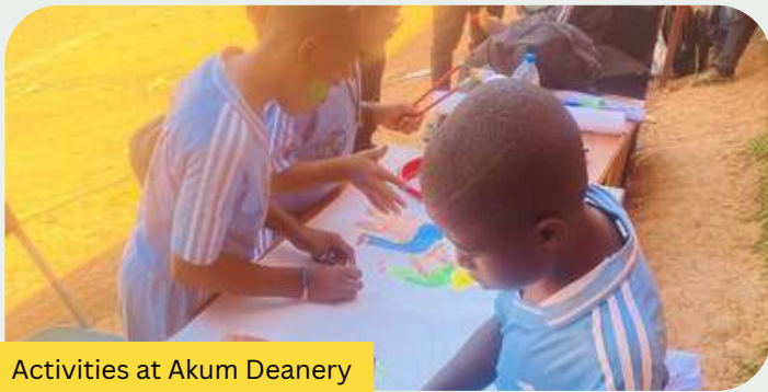
Activities at Akum Deanery