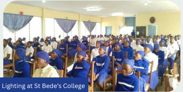
Lighting at St Bede's College

Three of our Diocesan secondary schools are twinned with Bamendan schools. Bishop Challoner Secondary School has had a long-held link with St. Bede's College in Ashing-Kom. This year the students raised over £6,000 to fund the purchase and installation of solar panels for a renewal, reliable energy source for the College which have now been installed and are providing a reliable and efficient source of electricity.